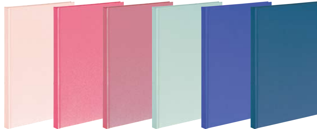
1 (Light Pink) 2 (Coral Pink) 3 (Plum) 4 (Pale Turquoise) 5 (Royal Blue) 6 (Night Blue)