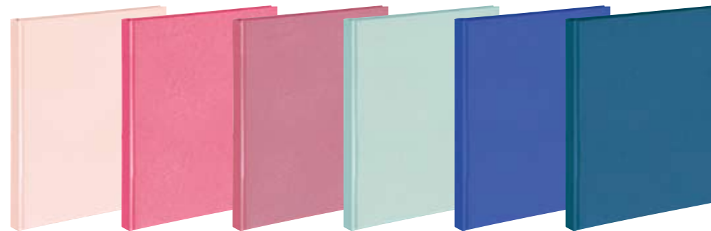
1 (Light Pink) 2 (Coral Pink) 3 (Plum) 4 (Pale Turquoise) 5 (Royal Blue) 6 (Night Blue)