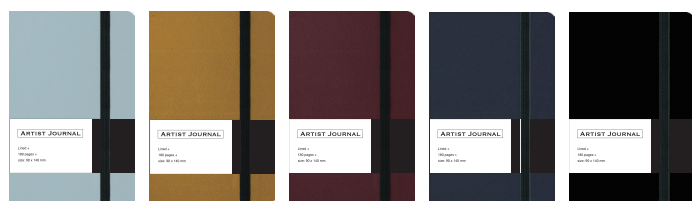
LB (Pale Blue)