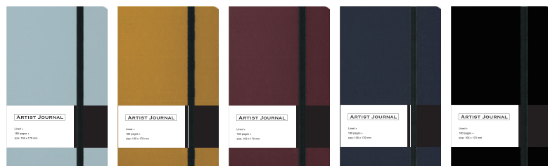
LB (Pale Blue)