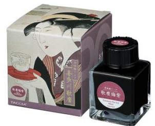
TFPI-WD42-16 UTAMARO- UMEMURASAKI

Utamaro created an absolutely new type of female beauty which is featuring delicate and elegant drawing lines, pursuing beauty of various forms and expressions.