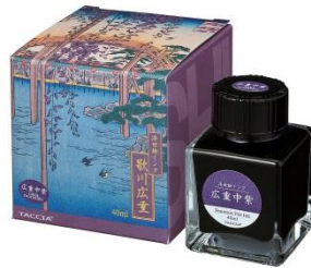
TFPI-WD42-11 HIROSHIGE- NAKAMURASAKI